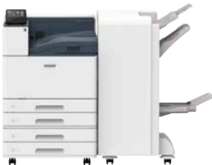
With 2 Tray Module and C3 Finisher with Booklet Maker

Staple capacity of up to 50 / 65 sheets* / Punch* / Saddle Staple / Single Fold