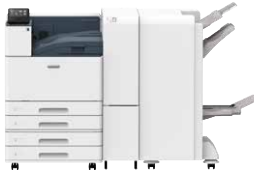
With 2 Tray Module and C3 Finisher with Booklet Maker and Folder Unit CD1

Staple capacity of up to 50 / 65 sheets* / Punch* / Saddle Staple / Single Fold